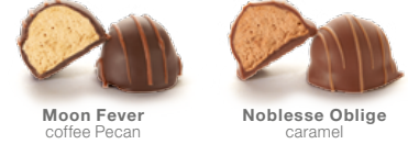
Moon Fever coffee Pecan