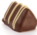
Dark Pistachio Marzipan