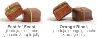
East 'n' Feast gianduja, cinnamon ganache & apple jelly