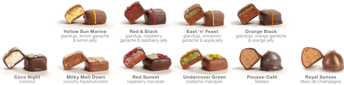
Yellow Sun Marine gianduja, lemon ganache & lemon jelly