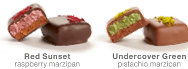
Red Sunset raspberry marzipan