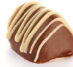
Milk Coconut Pineapple