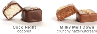
Coco Night coconut