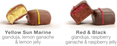
Yellow Sun Marine gianduja, lemon ganache & lemon jelly