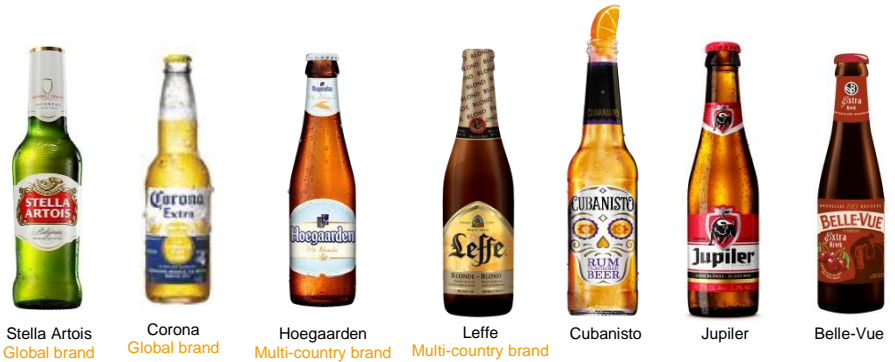
Stella Artois Global brand

As well as two of our global brands, we also offer a wide range of local and specialty beers. These include: