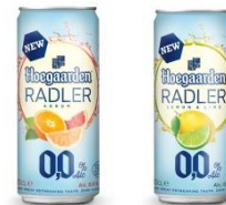
2016 Beer Innovation Hoegaarden Radler 0.0 Agravum and Lemon & Lime