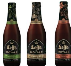
2015 Beer Innovation Leffe Royale range