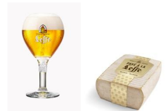
2016 Experience Innovation New glassware and food pairing with Pavé à la Leffe