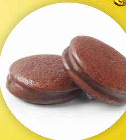
Melano > non-lauric CBR