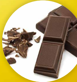
^ Palmy CBE - CBI