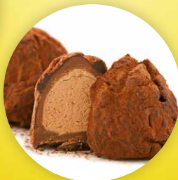
Ertifresh cool melting