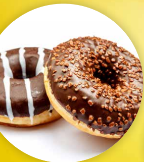
^ Palkena lauric CBS