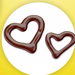
^ Redusat low SAFA