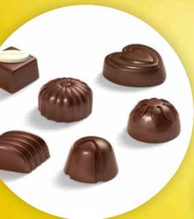
Ertifil Max all purposes