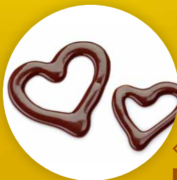
Redusat low SAFA

For use in confectionery fillings, biscuit creams, spreads and bake stable fillings