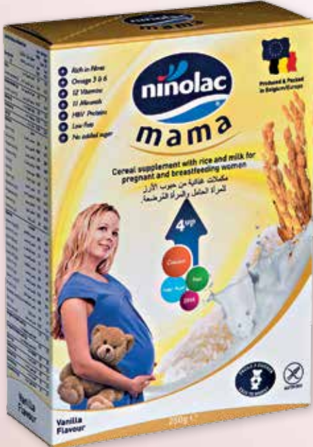
Mama - 250g For pregnant and breastfeeding women