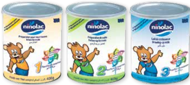
Infant formula/Follow-up formula/Growing up milk 400g and 900g