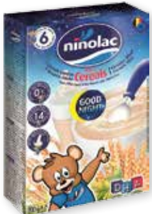
7 Cereals "Good Night"