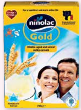
Gold - 250g For seniors