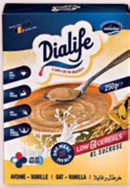
Dialife - 250g For diabetics