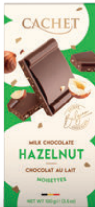
HAZELNUT MILK CHOCOLATE Ref: 21432 (12x100g in display)