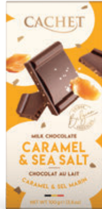
CARAMEL & SEA SALT MILK CHOCOLATE Ref: 21431 (12x100g in display)