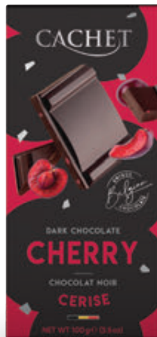
CHERRY DARK CHOCOLATE Ref: 21424 (12x100g in display)