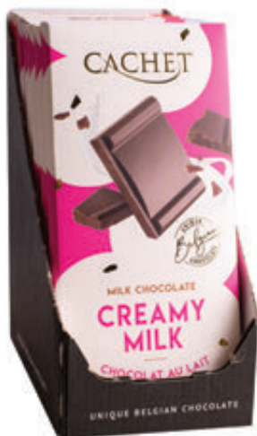
All of our 100g tablets are packed in displays per 12 PCS