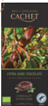
EXTRA DARK CHOCOLATE 85% Cacao Ref: 21355 (100g x 12 in display) *Certsys BE-BIO-01