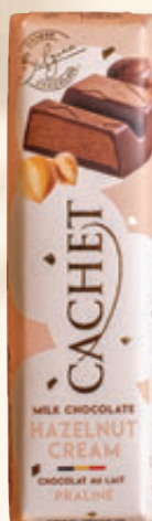
HAZELNUT CREAM MILK CHOCOLATE Ref: 22153 47g x 35 in display EN-FR-NL-DE-ES