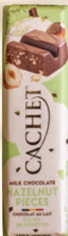
HAZELNUT PIECES MILK CHOCOLATE Ref: 22152 50g x 35 in display EN-FR-NL-DE-ES