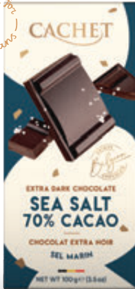
SEA SALT 70% CACAO EXTRA DARK CHOCOLATE Ref: 21429 (12x100g in display)