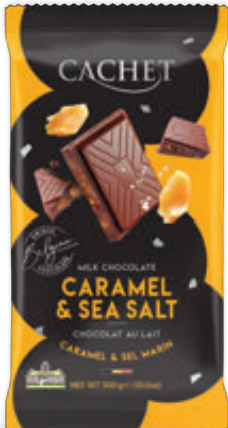
CARAMEL & SEA SALT MILK CHOCOLATE