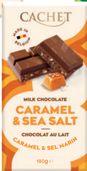
CARAMEL & SEA SALT MILK CHOCOLATE Ref: 22133 (15x180g in display)