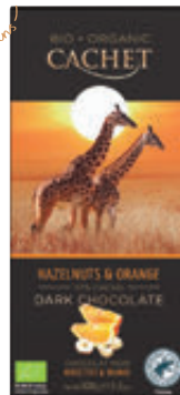
HAZELNUTS & ORANGE DARK CHOCOLATE 57% Cacao Ref: 21359 (100g x 12 in display) *Certsys BE-BIO-01