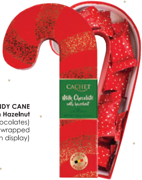
CANDY CANE Milk Chocolates with Hazelnut Ref: 12145 (100g - 11 Chocolates) Individually wrapped (16 in display)