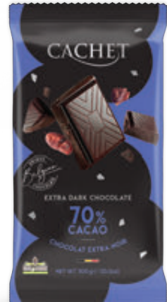
DARK CHOCOLATE 70% CACAO