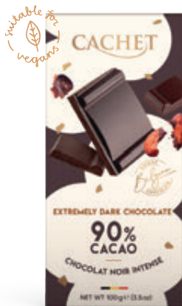
90% CACAO EXTREMELY DARK CHOCOLATE Ref: 21425 (12x100g in display)