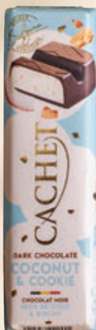
COCONUT & COOKIE DARK CHOCOLATE Ref: 22155 45g x 35 in display EN-FR-NL-DE-ES