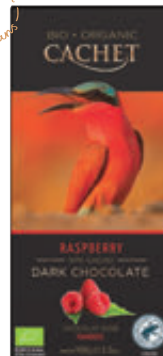
RASPBERRY DARK CHOCOLATE 57% Cacao Ref: 21360 (100g x 12 in display) *Certsys BE-BIO-01