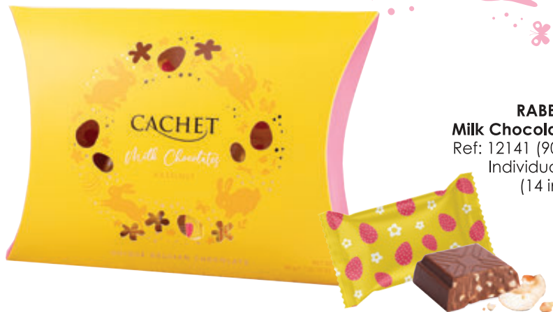
RABBIT'S HOLE Milk Chocolates with Hazelnut Ref: 12141 (90g - 10 Chocolates) Individually wrapped (14 in display)