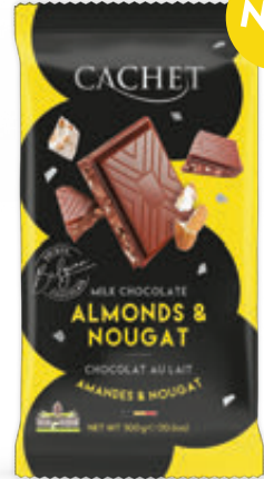
ALMONDS & NOUGAT MILK CHOCOLATE