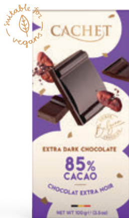
85% CACAO EXTRA DARK CHOCOLATE Ref: 21426 (12x100g in display)