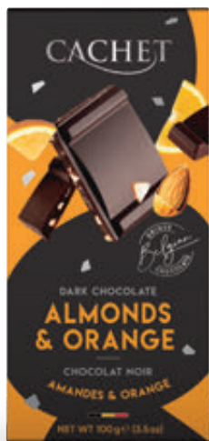
ALMONDS & ORANGE DARK CHOCOLATE Ref: 21421 (12x100g in display)