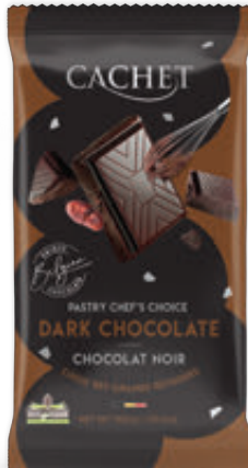
DARK CHOCOLATE 54% CACAO