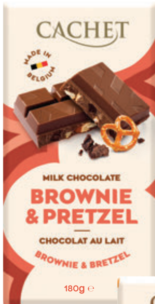
BROWNIE & PRETZEL MILK CHOCOLATE Ref: 22132 (15x180g in display)

Satisfy your sweet cravings with our new chocolate bars. These smooth and irresistible flavors will treat your taste buds with pure magic.