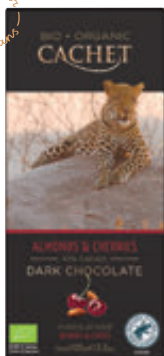
ALMONDS & CHERRIES DARK CHOCOLATE 57% Cacao Ref: 21358 (100g x 12 in display) *Certsys BE-BIO-01