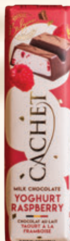
YOGHURT RASPBERRY MILK CHOCOLATE Ref: 22154 45g x 35 in display EN-FR-NL-DE-ES