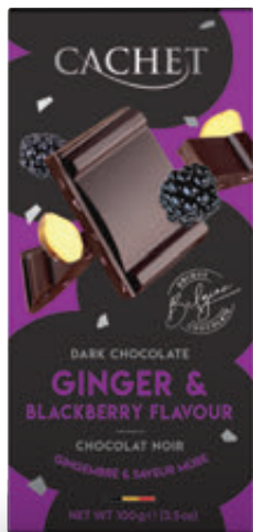
GINGER & BLACKBERRY FLAVOUR DARK CHOCOLATE Ref: 21423 (12x100g in display)