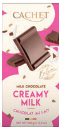
CREAMY MILK CHOCOLATE Ref: 21427 (12x100g in display)