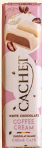
COFFEE CREAM WHITE CHOCOLATE Ref: 22156 45g x 35 in display EN-FR-NL-DE-ES