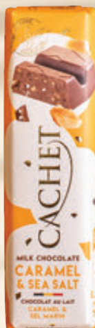
CARAMEL & SEA SALT MILK CHOCOLATE Ref: 22151 50g x 35 in display EN-FR-NL-DE-ES