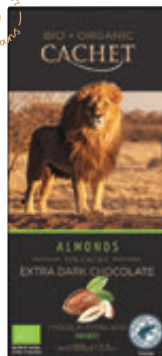
ALMONDS EXTRA DARK CHOCOLATE 72% Cacao Ref: 21357 (100g x 12 in display) *Certsys BE-BIO-01