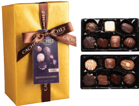
GOLD GIFT BALLOTIN Milk, Dark & White Chocolate Assortment Ref: 12128 (200g - 14 Chocolates) (12 in display)