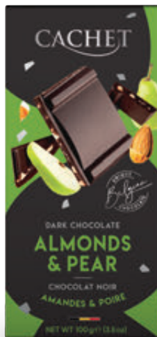
ALMONDS & PEAR DARK CHOCOLATE Ref: 21422 (12x100g in display)