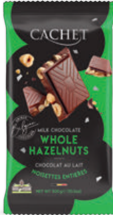
WHOLE HAZELNUTS MILK CHOCOLATE