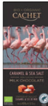
CARAMEL & SEA SALT MILK CHOCOLATE 40% Cacao Ref: 21361 (100g x 12 in display) *Certsys BE-BIO-01