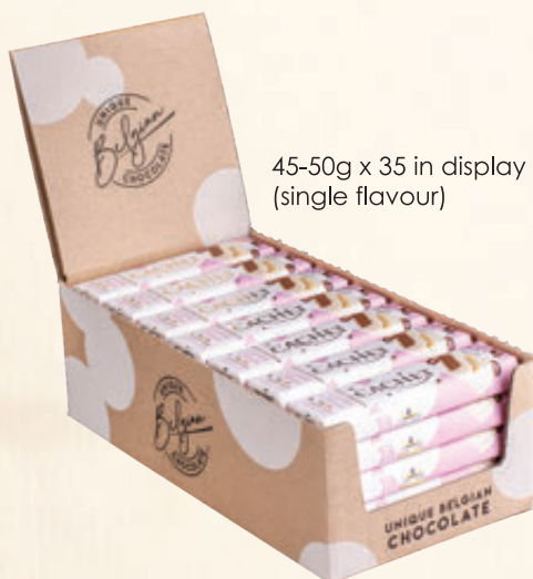
45-50g x 35 in display (single flavour)