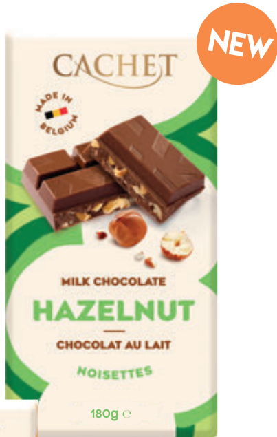
HAZELNUT MILK CHOCOLATE Ref: 22131 (15x180g in display)