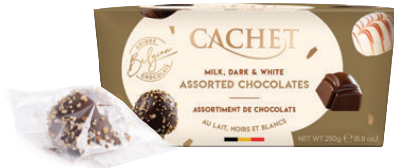
Milk, Dark & White Chocolate Assortment Ref: 12129 (250g - 18 Chocolates) Individually wrapped (8 in display)