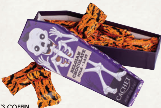
SKELLY'S COFFIN Milk Chocolates Ref: 12147 (120g - 13 Chocolates) Individually wrapped (16 in display)