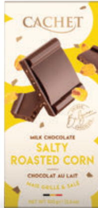
SALTY ROASTED CORN MILK CHOCOLATE Ref: 21430 (12x100g in display)