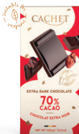
70% CACAO EXTRA DARK CHOCOLATE Ref: 21428 (12x100g in display)