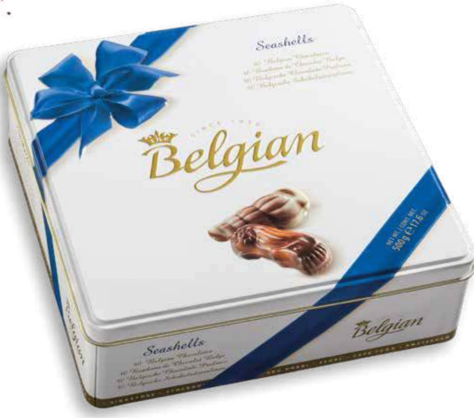
METAL BOX 30 - Seashells Original (500g)