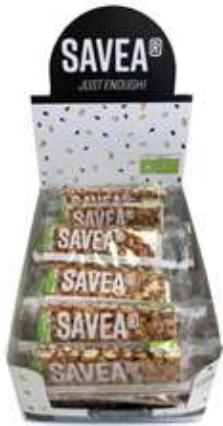
SAVEA BARS 24 SKU/SHOWBOX