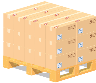
PALLET : 42 OVERCARTON