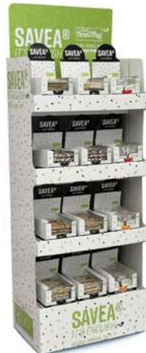
FLOOR DISPLAY 60 X 40 X 130 CM