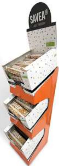
COUNTER DISPLAY 17 X 19 X 50 CM