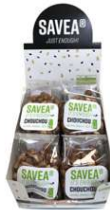
CARAMELIZED PEANUTS OR ALMONDS 10 SKU/SHOWBOX