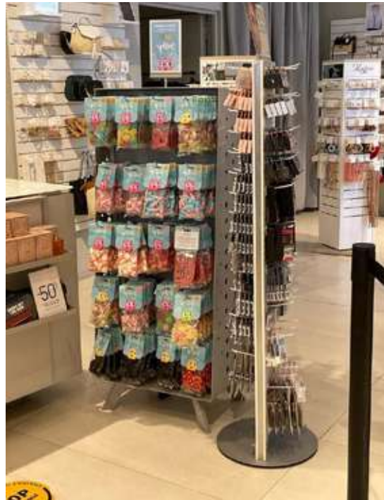
OVS - ITALY