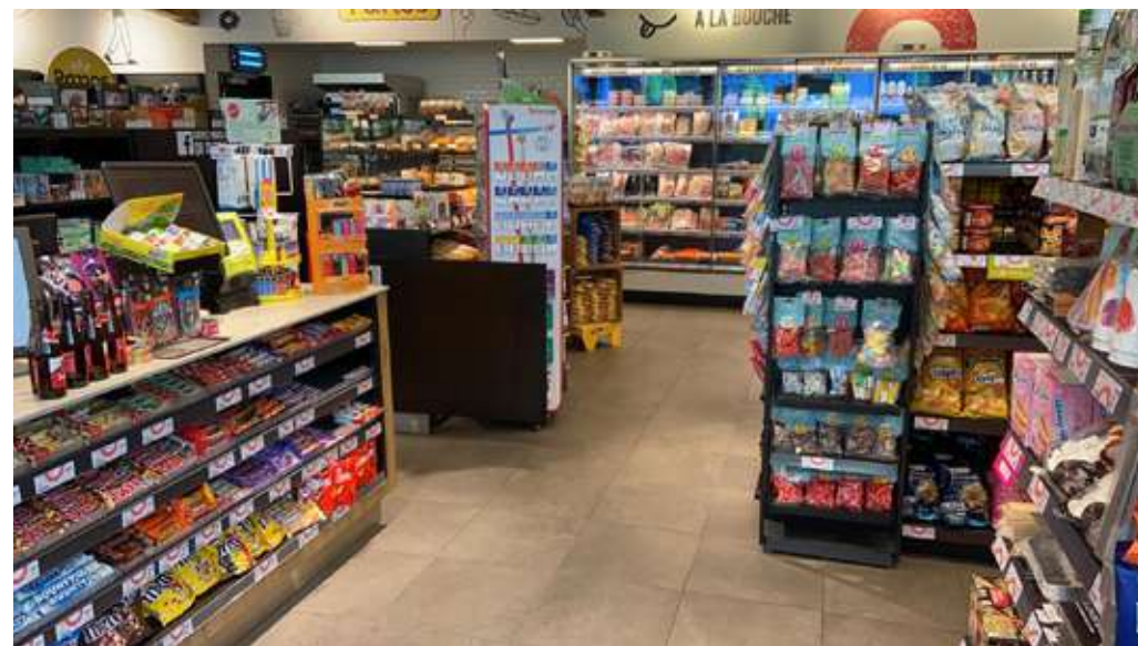
SHOP & GO - DELHAIZE