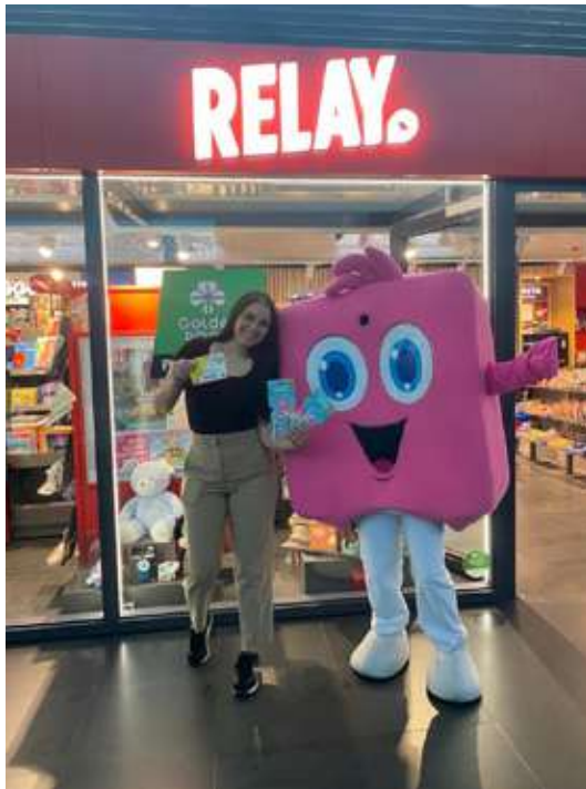
RELAY - BRUGGES BELGIUM