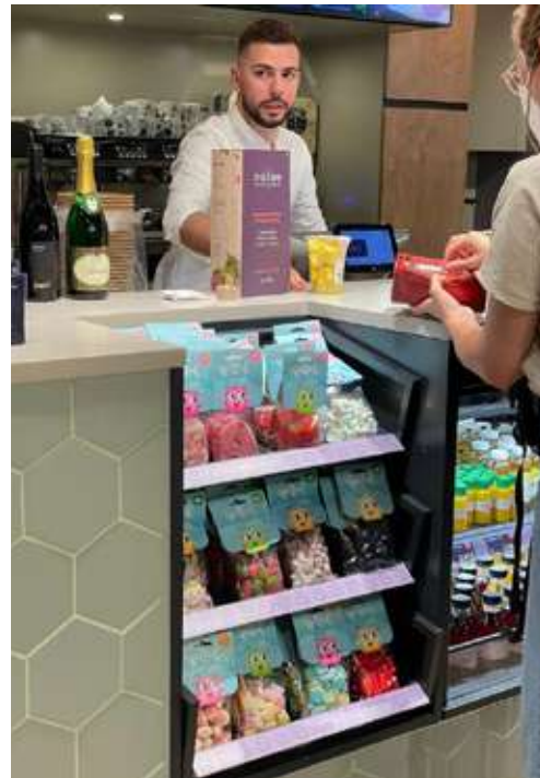
NATOO - AIRPORT FRANCFORT