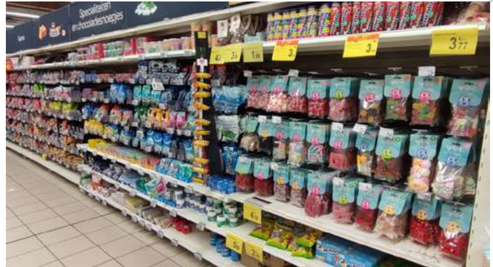
CORA - BELGIUM