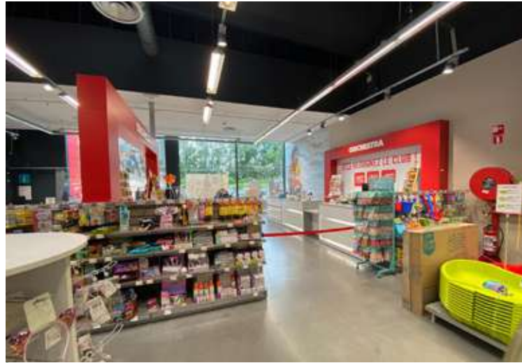
ORCHESTRA - BELGIUM