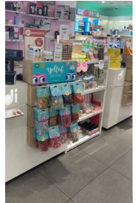
DI - BELGIUM DRUGSTORE