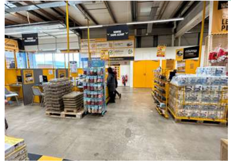
ELECTRO DEPÔT - BELGIUM