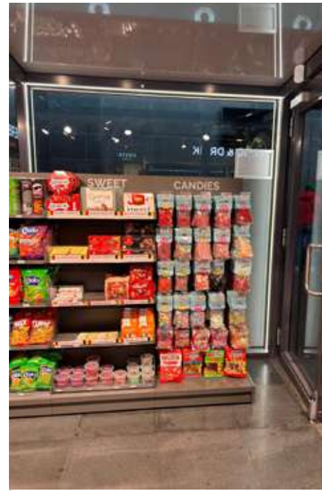
AIRPORT BRUSSELS SOUTH