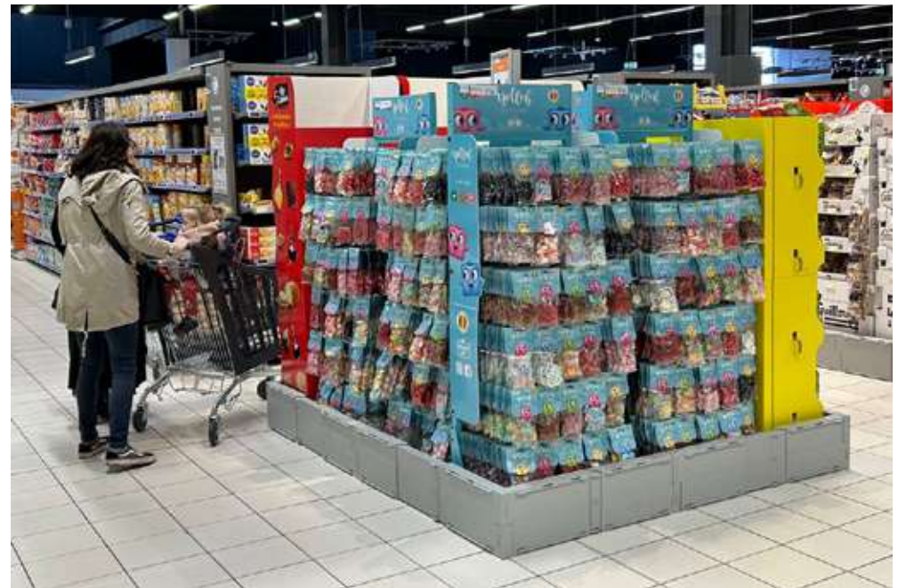
LECLERC - FRANCE