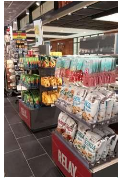
RELAY - HAMBOURG AIRPORT