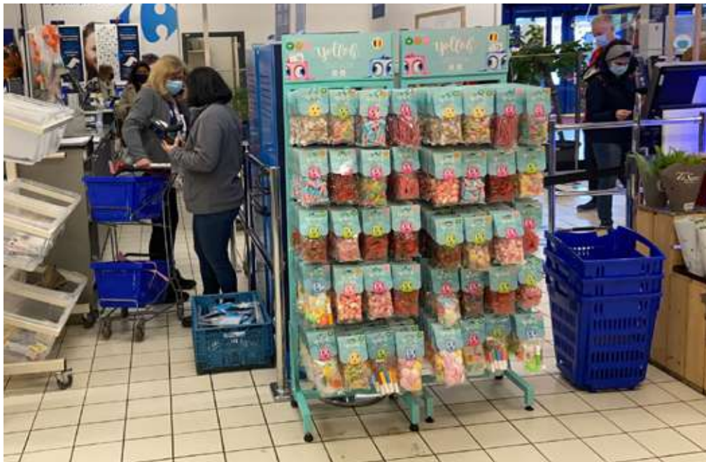
CARREFOUR - BELGIUM