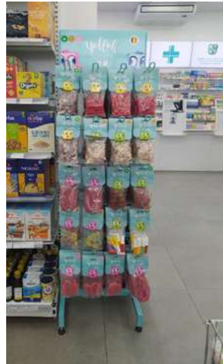
GEPHA - GEORGIA