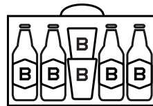
GIFTBOX : 4X50CL + 2 GLASSES