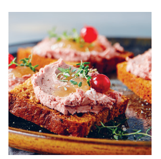
Paté, foie gras, or faux gras: For a luxurious and rich flavor experience that elevates the soft gingerbread to a higher culinary level.