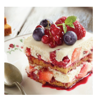
Dessert: Soft gingerbread pairs easily with fruit and red berries for all your dessert creations.

These toppings offer a wide range of possibilities, from refined and luxurious to vegetarian and internationally loved. They pair perfectly with our soft gingerbread canapés, offering your customers a unique and unforgettable taste experience.