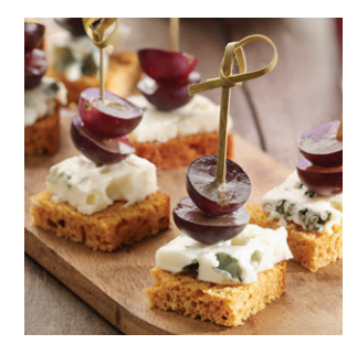
Cheese: From brie and goat cheese to blue cheese or camembert, optionally combined with fig or date jam for an extra layer of flavor.